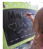
Trace over chalk with water

My spelling is wobbly. It's good spelling but it wobbles and the letters get in the wrong places.