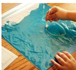
Paint in a freezer bag